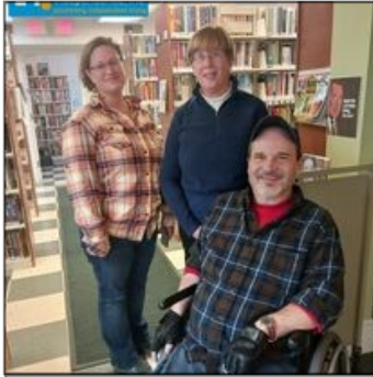
Access Independence Visit

The Library merges a historic residence with an addition built in 2002. The historic section of the house reflects the charm and hospitality of bygone days. The addition doubled the size of the Library and added library-like space.