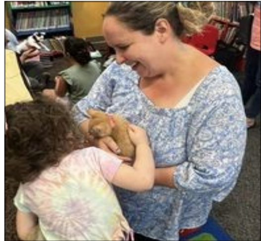
Summer Reading Program with Furry Friends